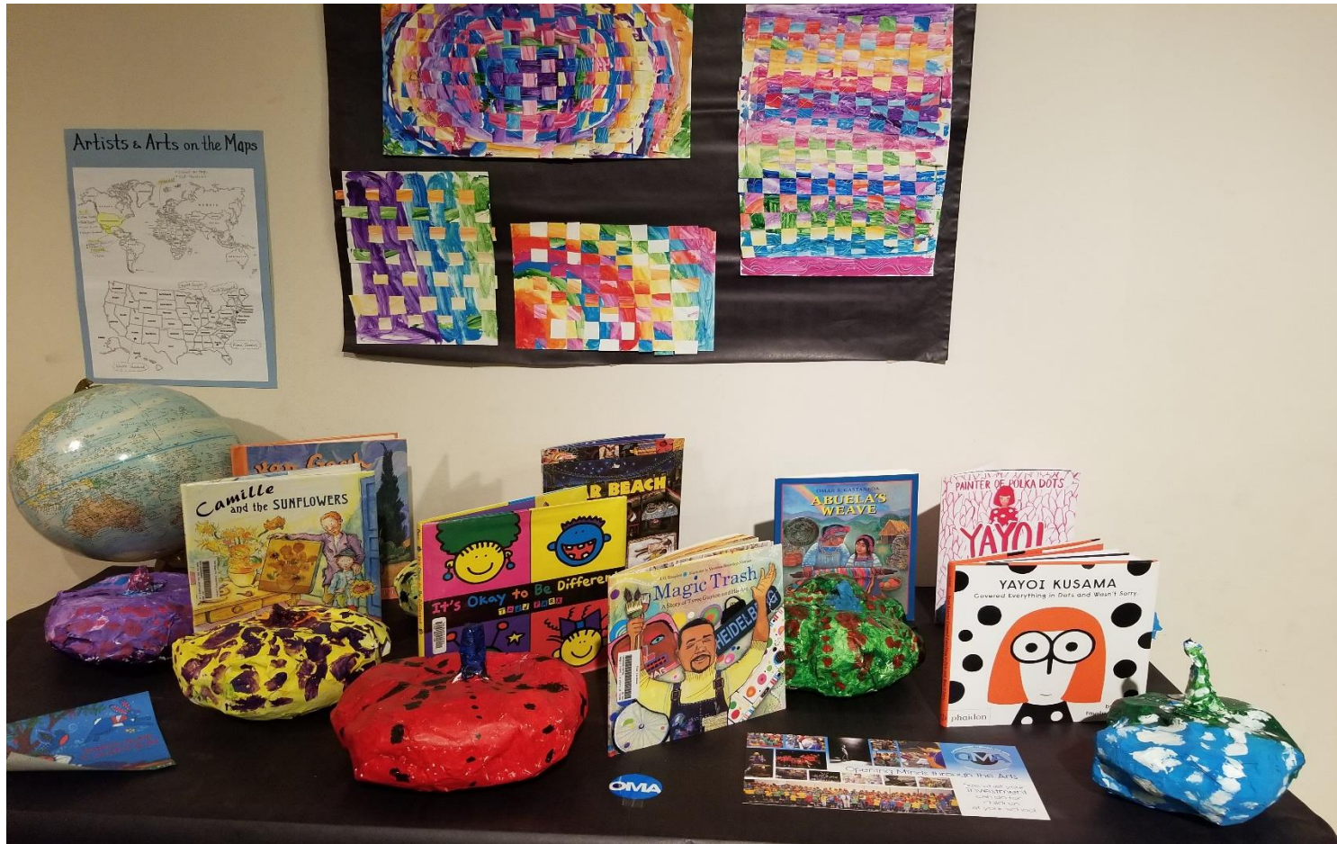
Van Buskirk Student Work – Multicultural Art, Science and ELA Integration Lesson