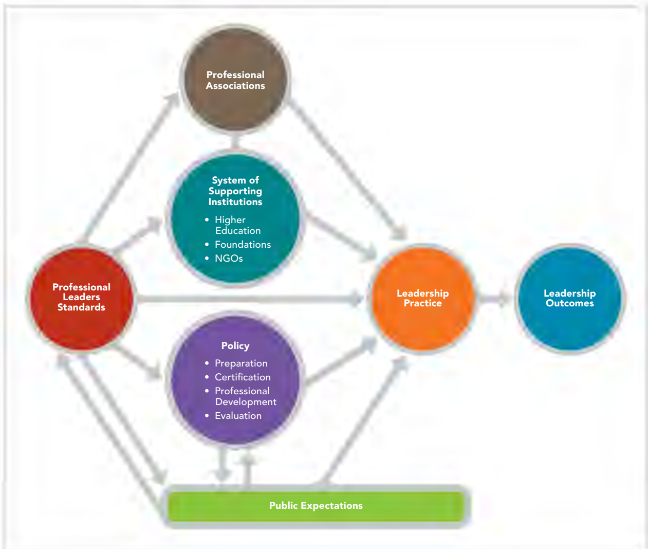
Figure 2: Theory-of-Action of the Role of Professional Standards in Leadership Practice and Outcomes

expectations for educational leaders over the course of their careers, from initial preparation, recruitment and hiring, to induction and mentoring, to evaluation and career-long professional learning. The Standards can guide the operationalization of practice and outcomes for leadership development and evaluation.