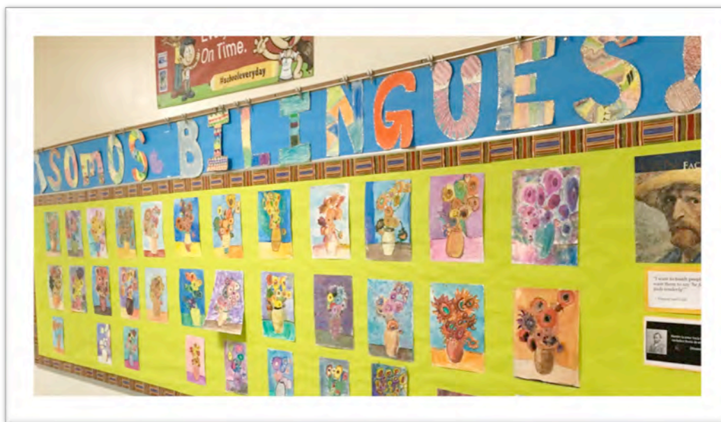
Positive messages about Bilingualism at the Roskruge Bilingual Magnet School April 2016