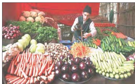
A teenage boy sells vegetables at a market in Peshawar, Pakistan, April 21, 2009.