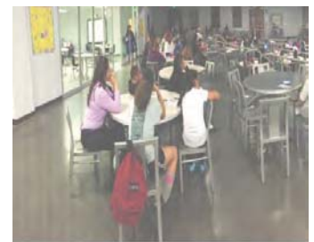
Parents attend Quarterly Meeting at Pueblo HS

SOAR/Expect More Arizona/ Pío Decimo Center/ Pima Community College Adult Education/Grad Link Agave/Desert Men's Council/University of Arizona Society of Hispanic Professional Engineers Southern Arizona/Arizona Cesar E. Chavez Holiday Coalition/ Tucson Hispanic Chamber of Commerce/University of Arizona Math Cats-Word Cats/Tucson Unified School District Board Members/LULAC League of United Latin American Citizens/Goodwill Good Guides /Child & Family Resources /Big Brothers-Big Sisters/University of Arizona Project SOAR/Expect More Arizona/ Pío Decimo Center/ Pima Community College Adult Education/Grad Link Agave/Desert Men's Council/University of Arizona Society of Hispanic Professional Engineers (SHPE)/Raytheon Mathematics Engineering Science Alliance (MESA)/ University of Arizona College of Education/Emmanuel Grace/City of Tucson Supervisors Ward V and Ward I/University of Arizona Hispanic Chamber/Regional College Access Center/ Pima County Health Department/I AM You 360/ Gap Ministries/Neighborhood Church/Pima County Public Library