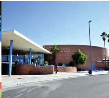
Catalina Family Center 3645 E. Pima Street (520) 225-6000