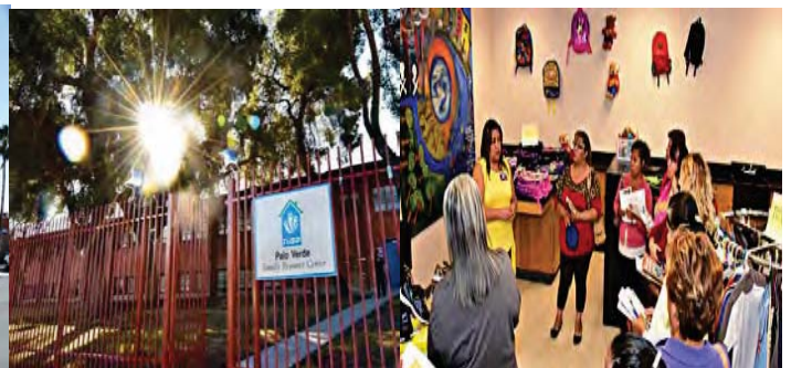
Palo Verde Family Center 1302 S Avenida Vega