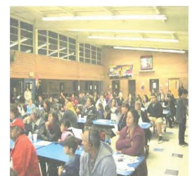
Parents attend McCorkle K-8 Parent Quarterly Meeting