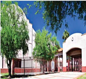
Wakefield Family Center 101 W 44th St. (520) 225-3800

Catalina | Palo Verde | Southwest | Wakefield