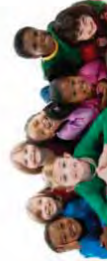
II - 42, p. 18