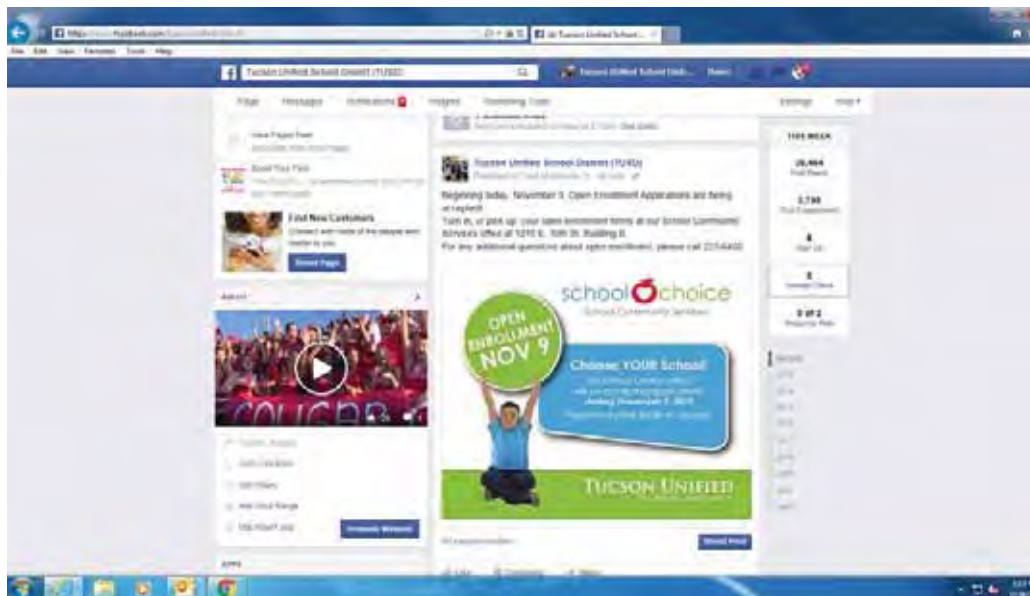
Posted on Facebook on 11/9/2015 at 12:45 pm