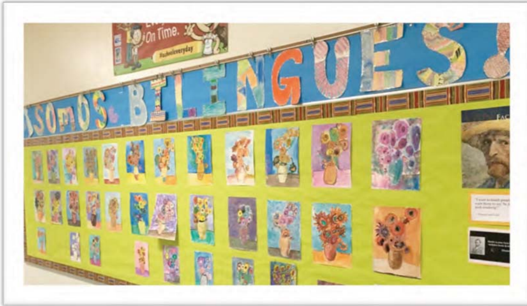
Positive messages about Bilingualism at the Roskruge Bilingual Magnet School April 2016